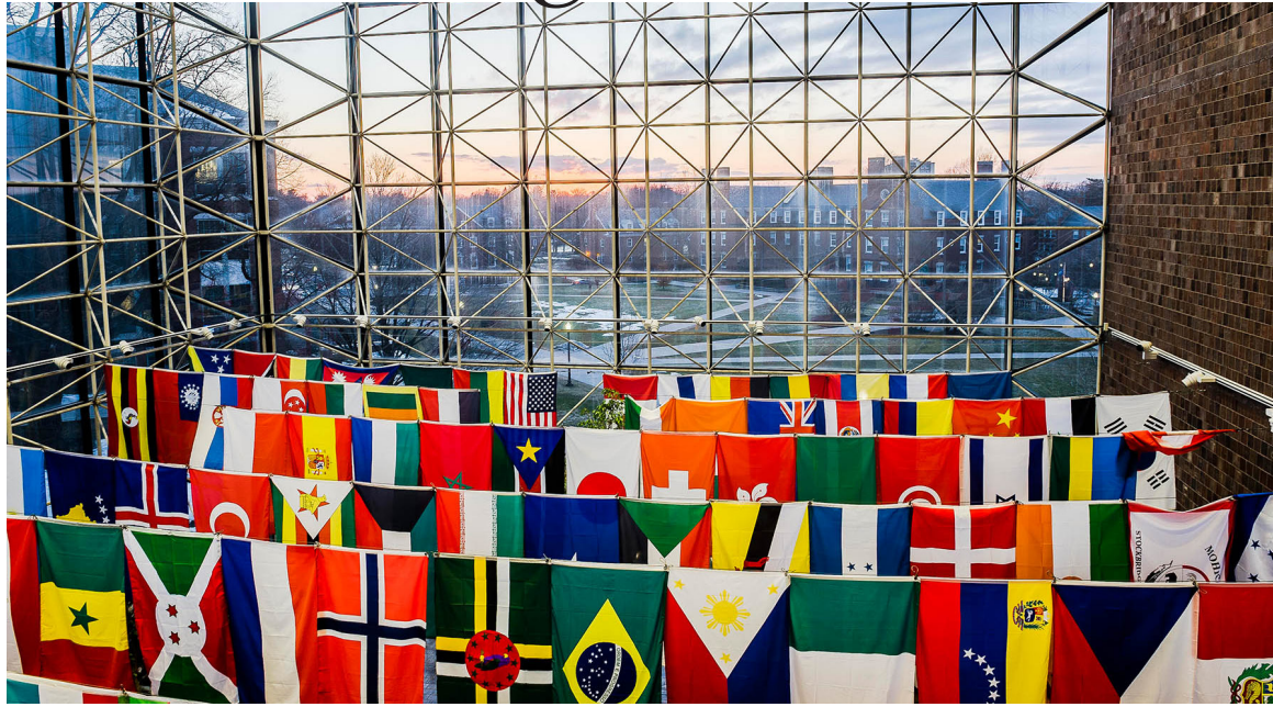
The Flags as currently displayed in Hirst Lounge.