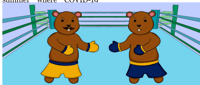
SUNAHRA TANVIR / STAFF ILLUSTRATOR

Woodchuck is a member of the class of 2023.