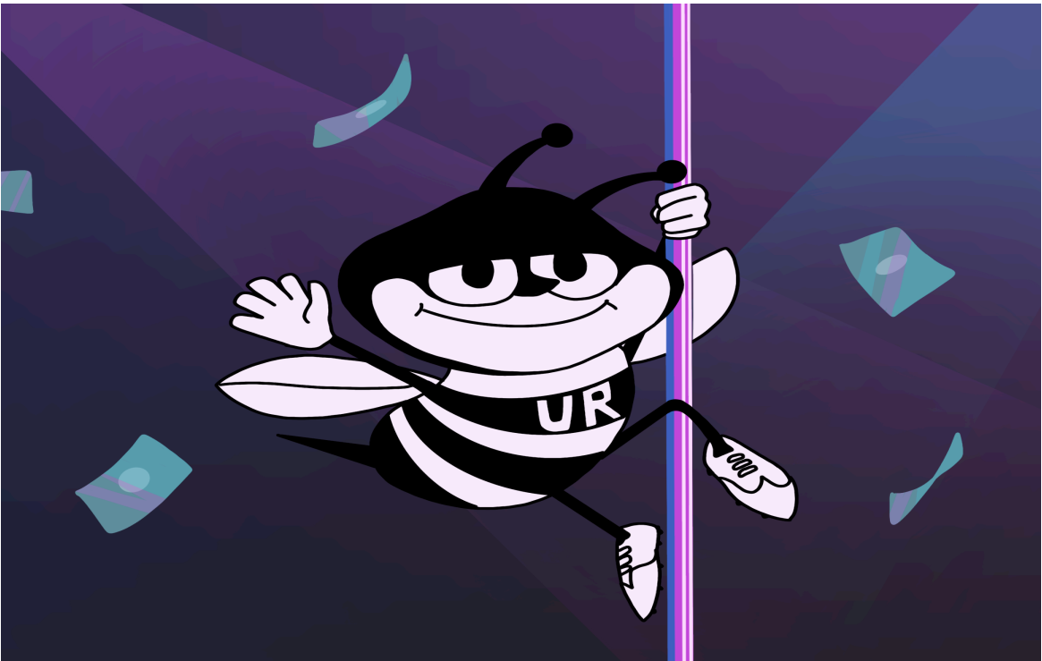
BRIDGET TOKIWA / SHE DRAWS THINGS

Seminars will be offered through the Department of