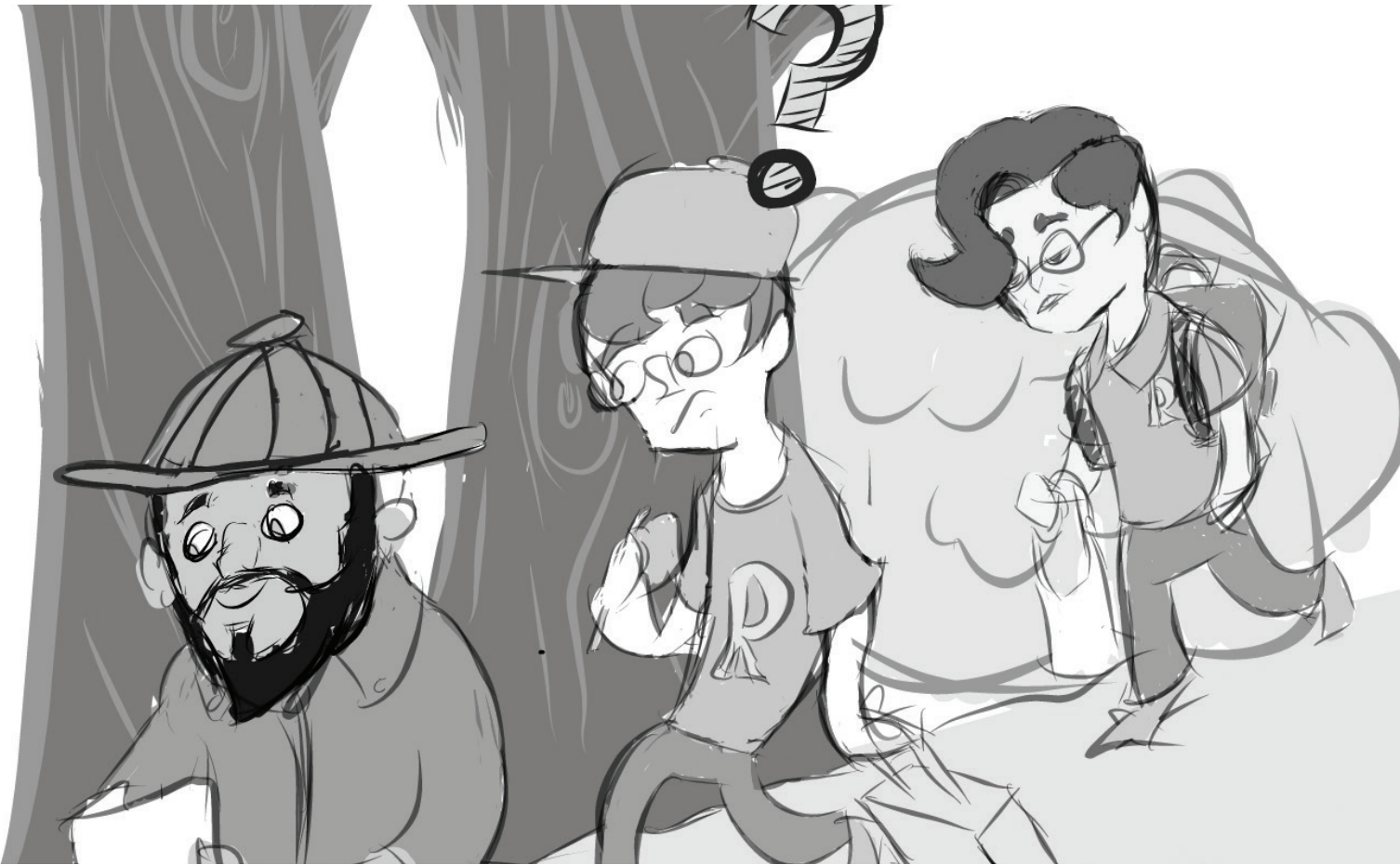
LUIS NOVA / ILLUSTRATOR