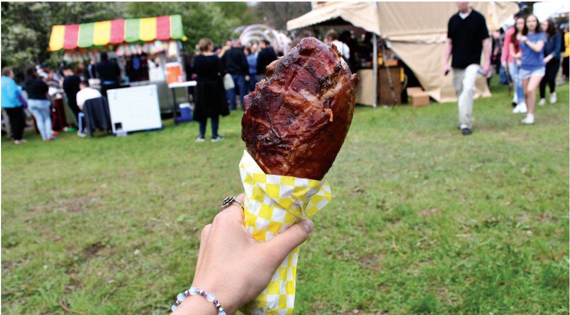
A giant purchase from the Smoked Turkey Legs station.