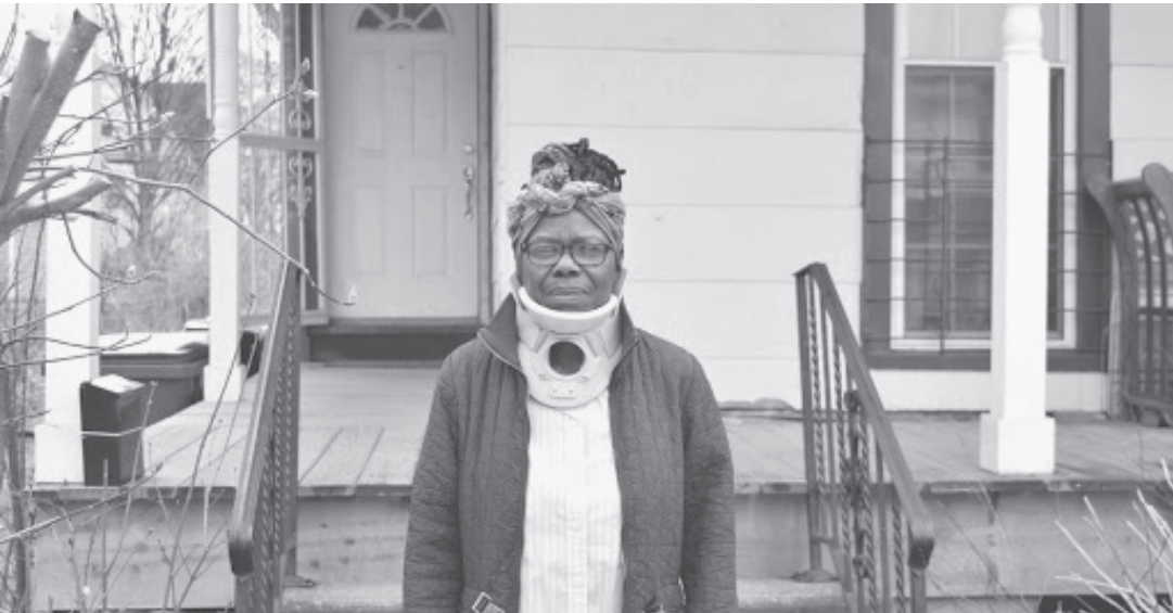
WIL AIKEN / MANAGING EDITOR