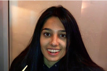
By SHWETA KOUL PUBLISHER

The Campus Times hit 75,000 site views last month. That’s our second-most after September 2017. Three of our seven highest viewed weeks ever came consecutively in April.